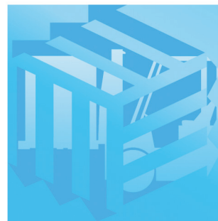
Manufacturing & Assembly Solutions