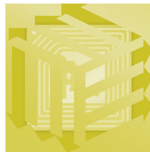
Information Technology (IT) Solutions